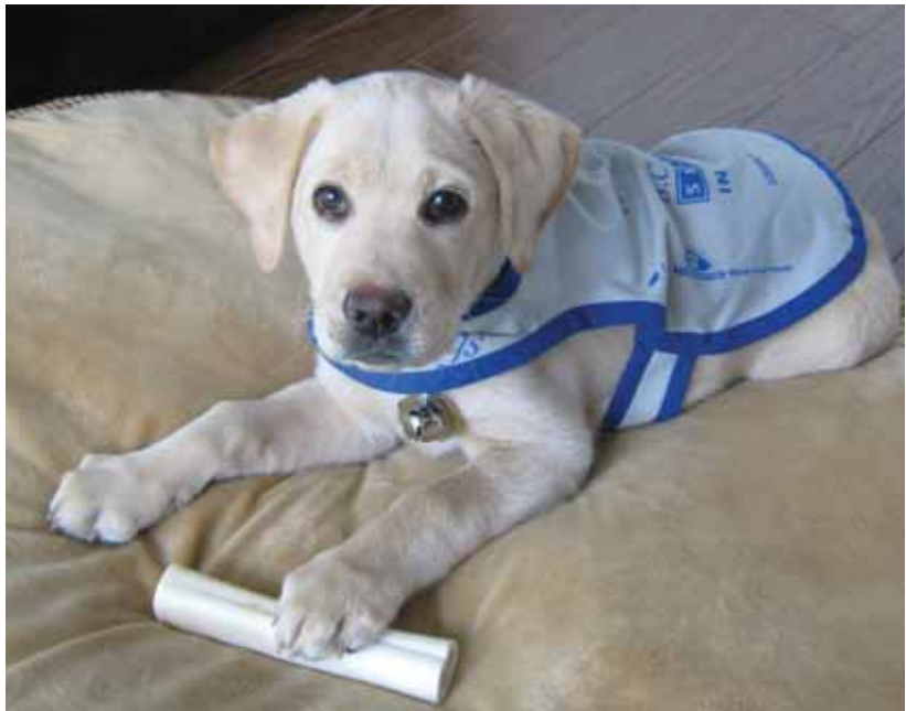
Gidget...in a break from training

Gidget is still a puppy, so she has a ways to go in her training, but she is doing well. Soon she will be off to "university". However, if she does not "make the grade" to be a guide dog for someone who is visually impaired,